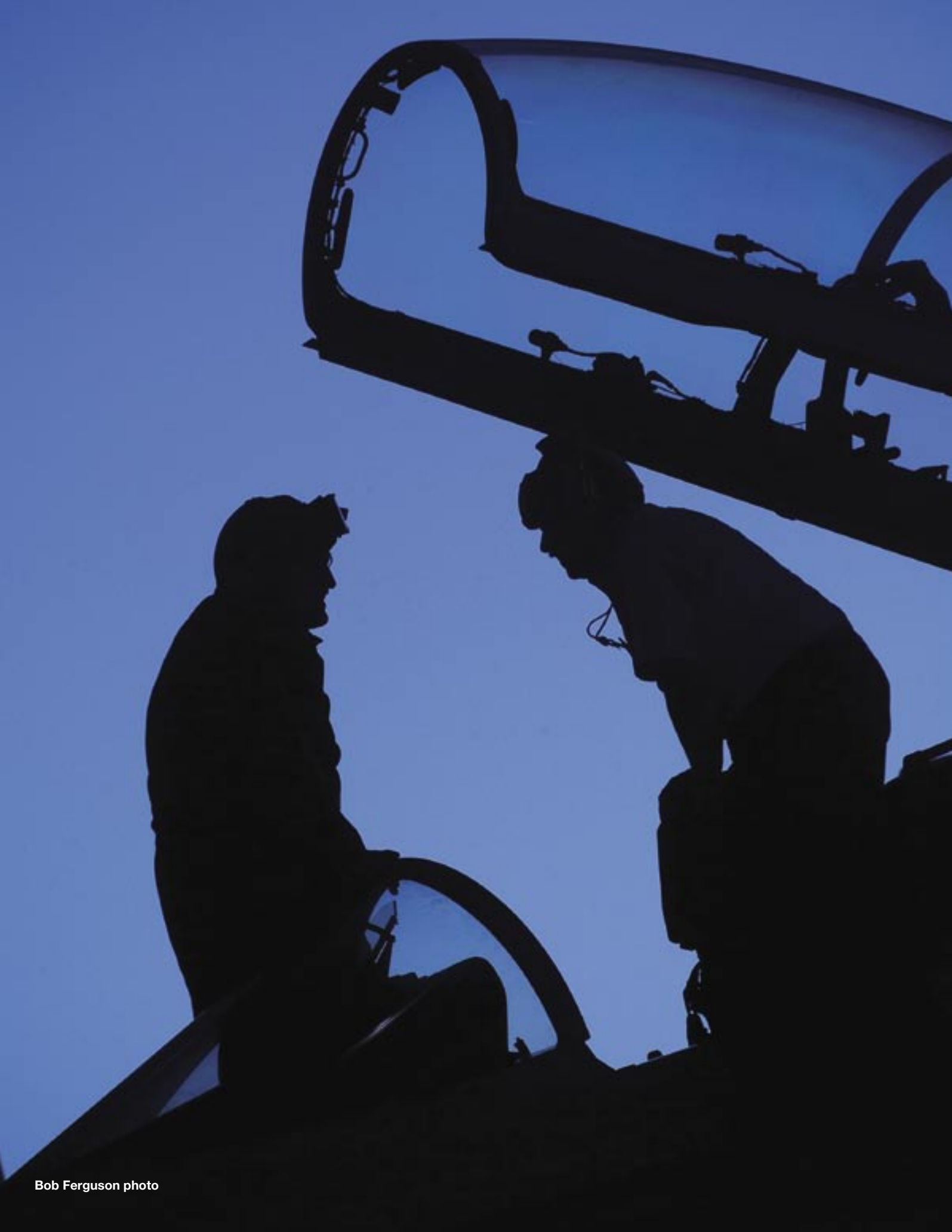
Bob Ferguson photo